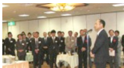
BUSINESS MEETING & RECEPTION