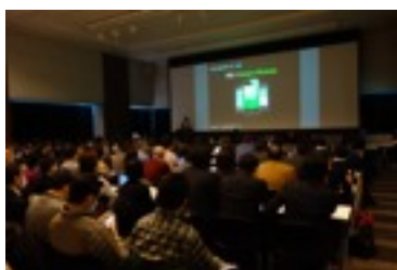
OGC(OPEN GAME CONFERENCE)