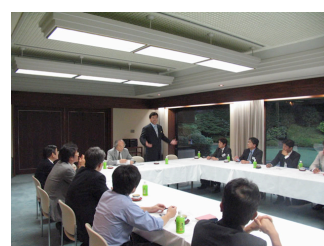
MEETING with LAWMAKER