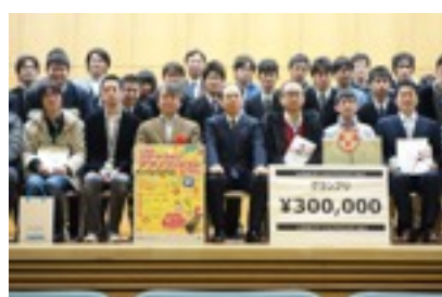
IIZUKA CITY APPLICATION CONTEST UNIVERSITY & INDUSTRY COLLABORATION