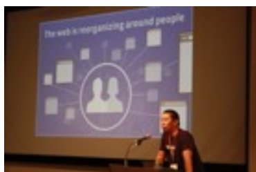
OMC(OPEN MEDIA CONFERENCE)