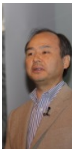
CHAIRMAN MASAYOSHI SON

We will continue to put all our strength into our endeavors to further accelerate the Information Revolution and bring happiness for everyone,