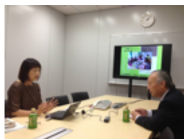
MEETING with BBA BOARD MEMBOR